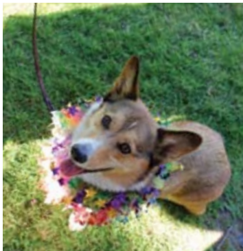
Below: Well behaved dogs, like Rhys, are always welcome!